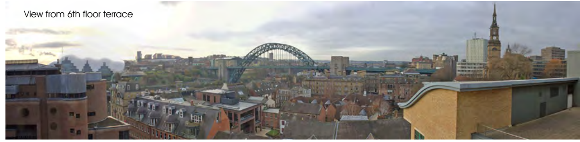
View from 6th floor terrace