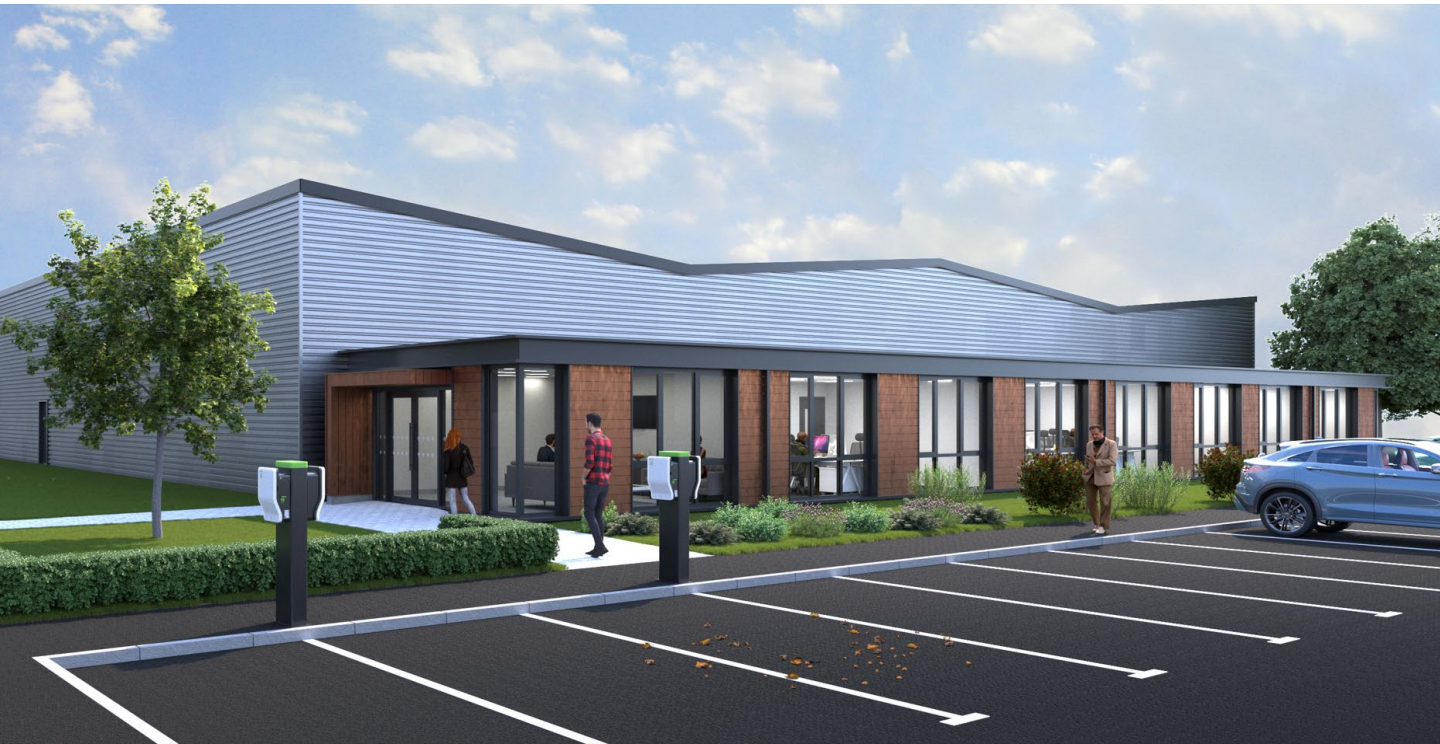
CGI showing unit post refurbishment

Unit E2, Tyne Tunnel Estate, North Shields, NE29 7XJ