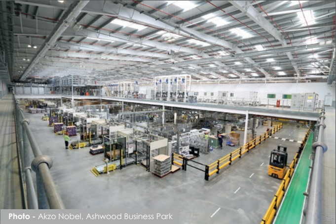
Photo - Akzo Nobel, Ashwood Business Park