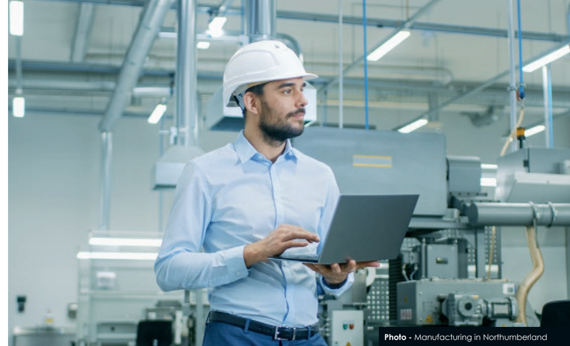
Photo - Manufacturing in Northumberland