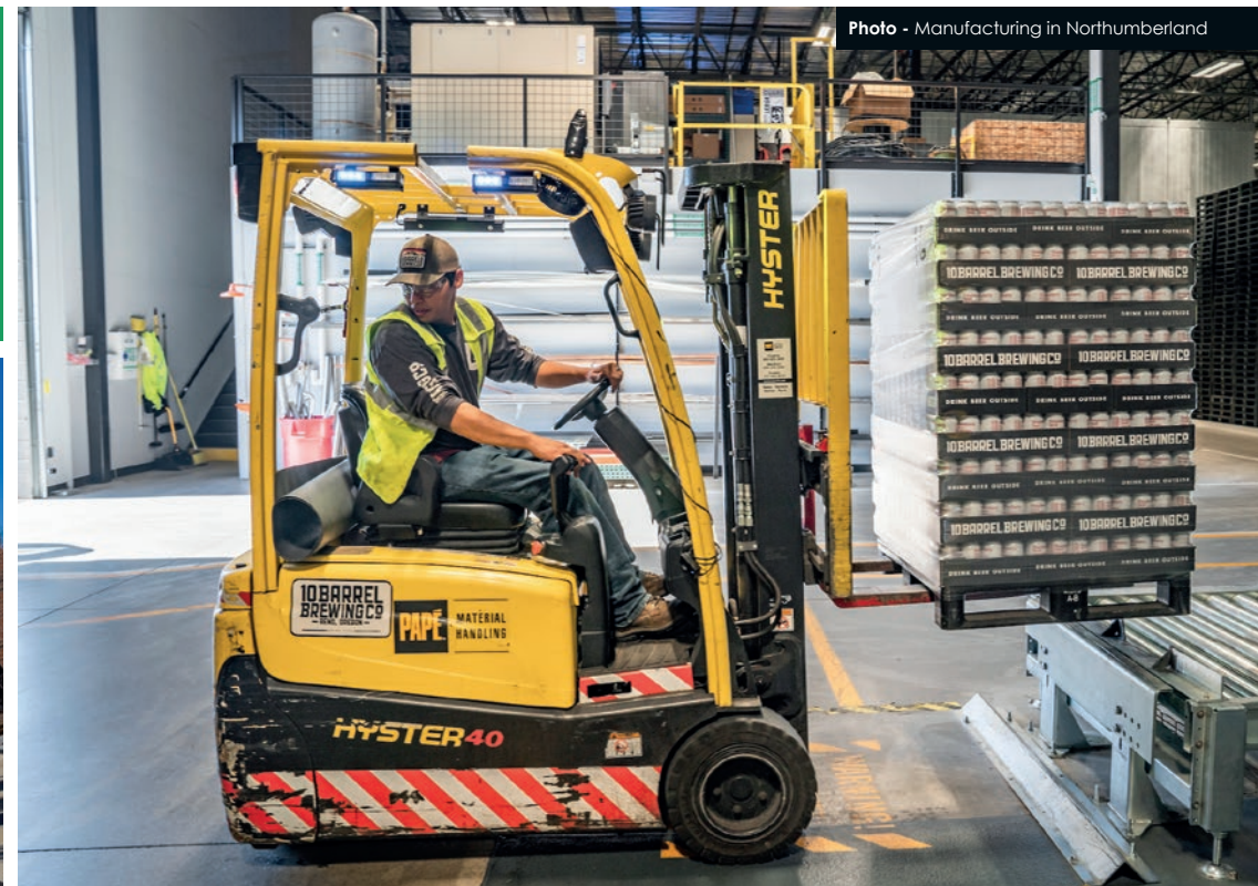
Photo - Manufacturing in Northumberland