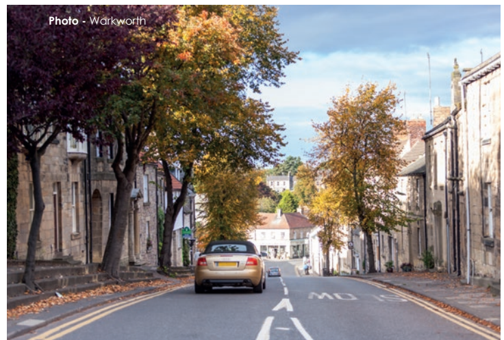
Photo - Warkworth