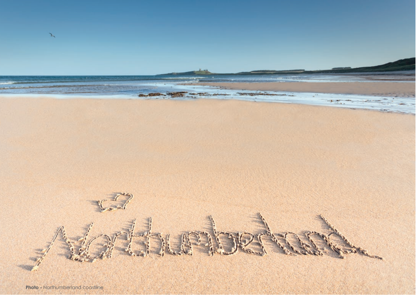
Photo - Northumberland coastline