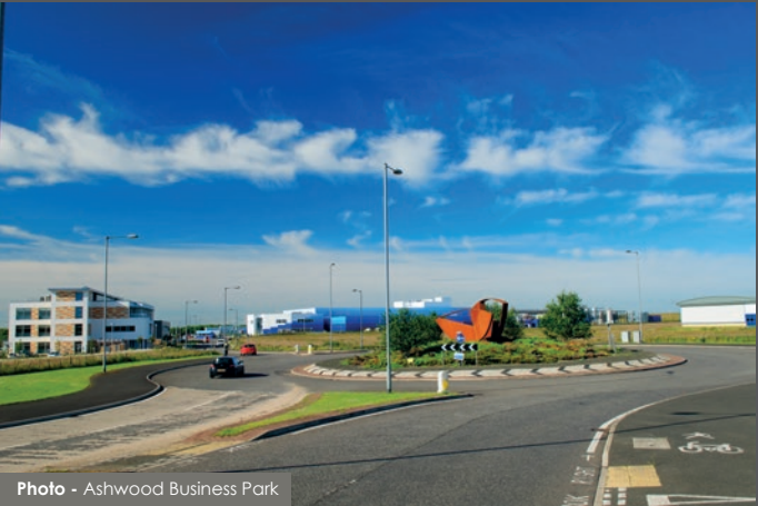
Photo - Ashwood Business Park