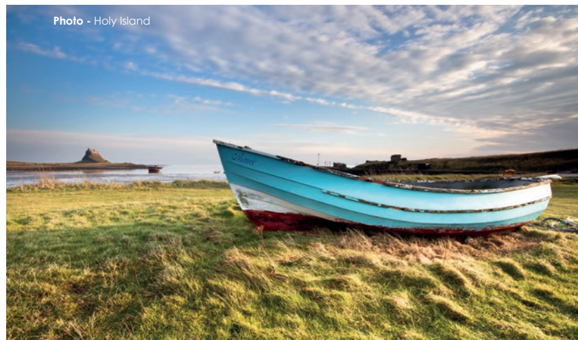
Photo - Holy Island