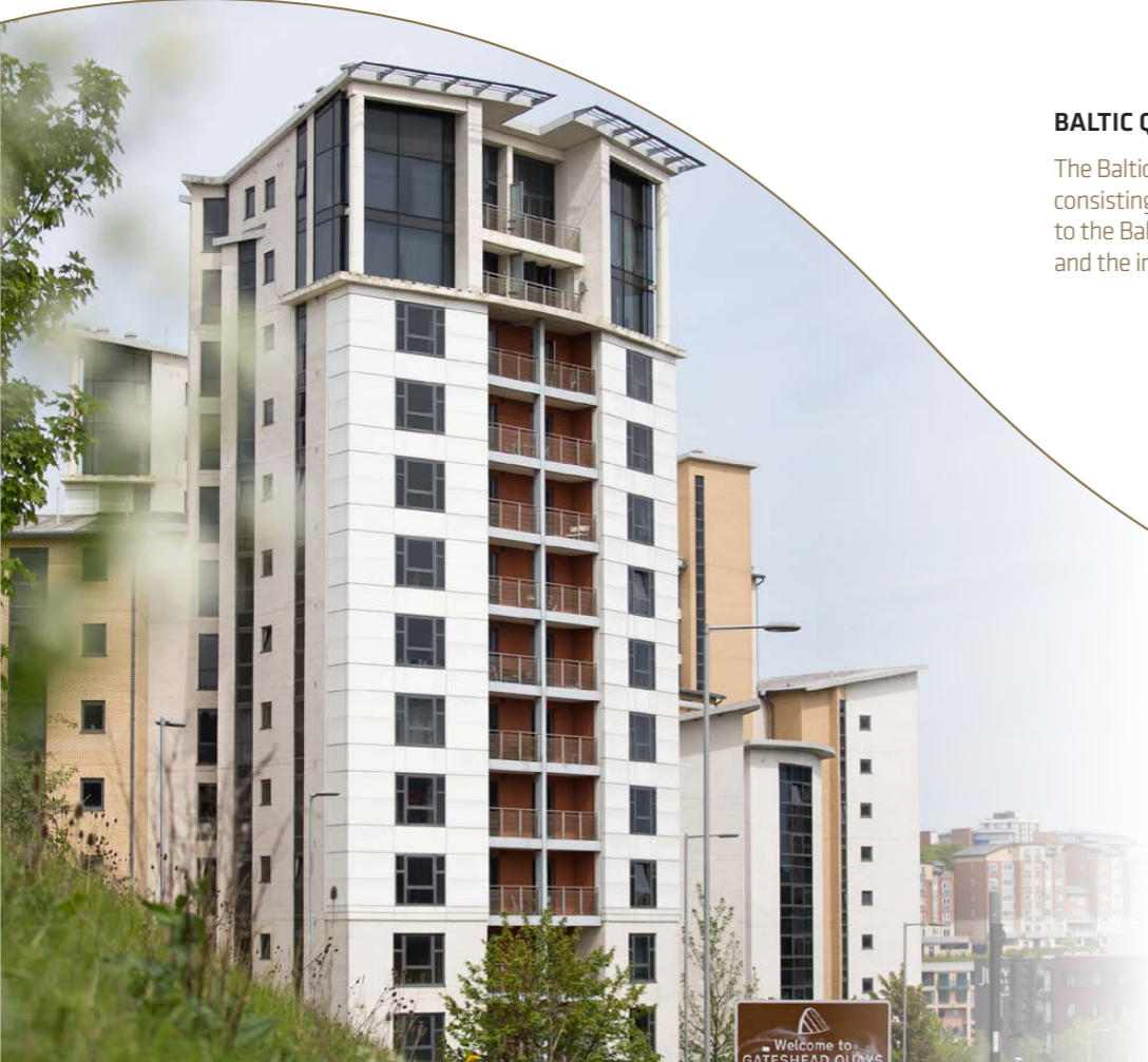
BALTIC QUAYS The Baltic Quays is a development consisting of luxury apartments adjacent to the Baltic Centre for Contemporary Art and the international Sage concert hall.

Number One Quayside is a very rare opportunity to acquire a prime residential on the Quayside amongst all of the social and business activity .