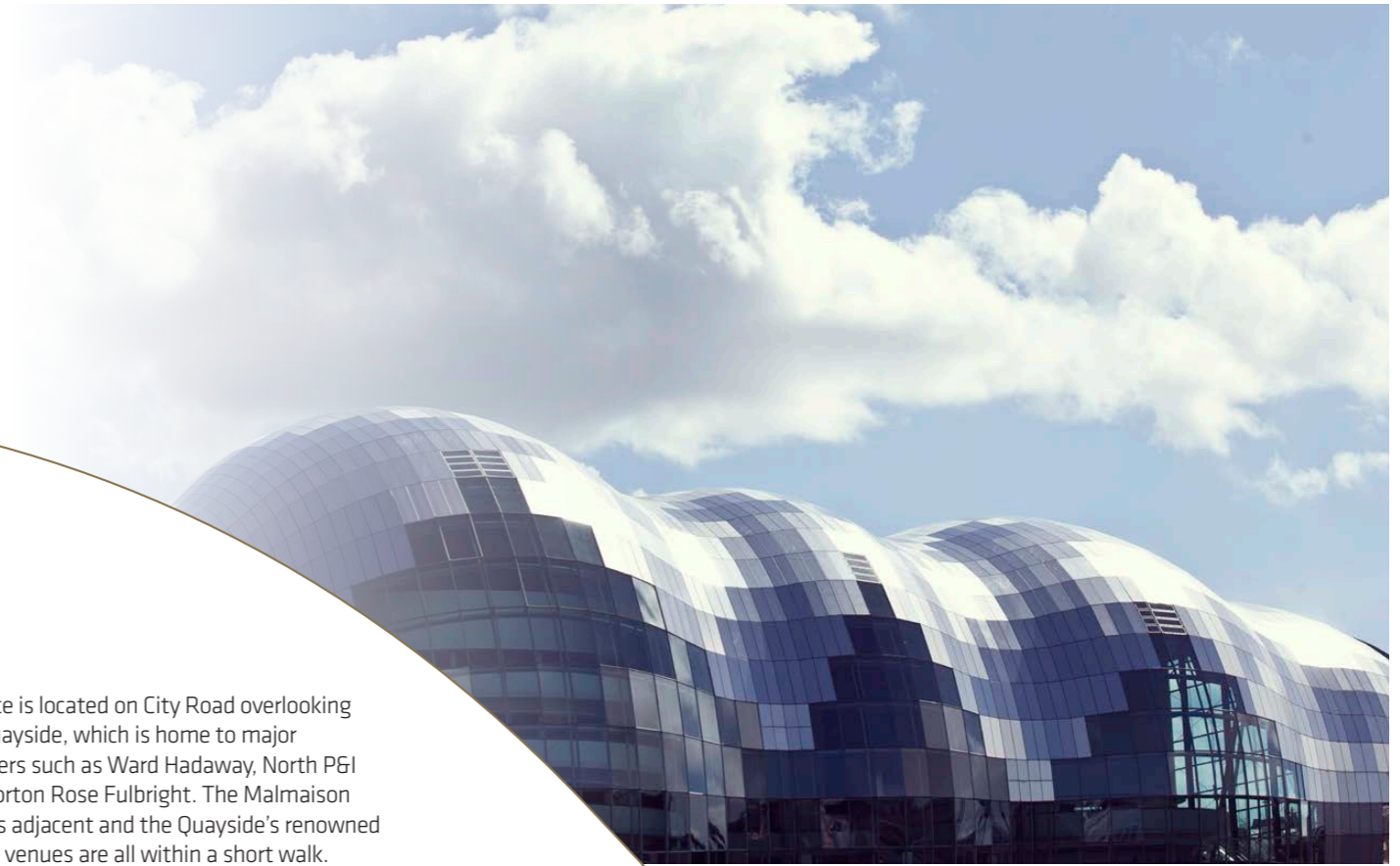
The SAGE Gateshead Music Centre

The site is located on City Road overlooking the Quayside, which is home to major occupiers such as Ward Hadaway, North PGI and Norton Rose Fulbright. The Malmaison hotel is adjacent and the Quayside's renowned leisure venues are all within a short walk.