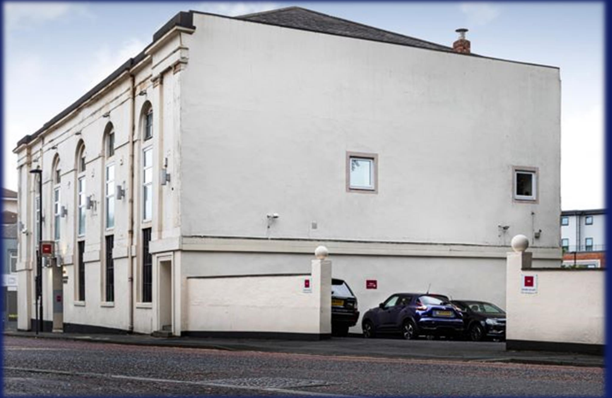
Buxton House, One Buxton Street, Newcastle upon Tyne NE1 6NJ